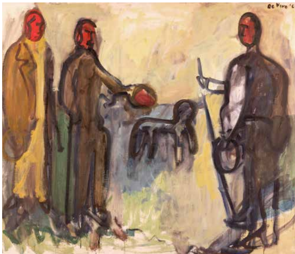
Gift from Robert De Niro (2020) On loan to Musée Fabre, Montpellier, France Robert De Niro Sr., Three Figures after Courbet, 1965

KBFUS ART operates under the guidance of our Art Advisory Committee, comprised of leading experts in the field. With their support, we make sure that donated artworks are displayed in the best possible environment, used in temporary exhibitions or made available for research, according to the donor's wishes and instructions.