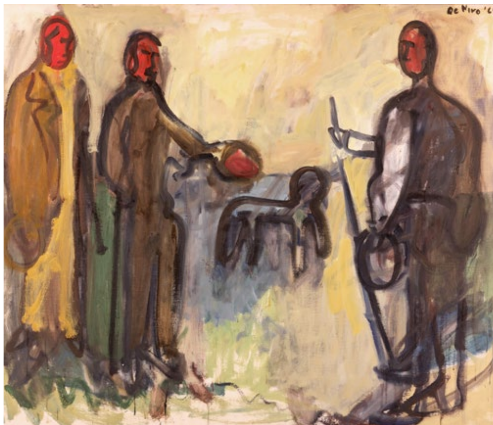
Gift from Robert De Niro (2020) On loan to Musée Fabre, Montpellier, France Robert De Niro Sr., Three Figures after Courbet, 1965

KBFUS ART operates under the guidance of our Art Advisory Committee, comprised of leading experts in the field. With their support, we make sure that donated artworks are displayed in the best possible environment, used in temporary exhibitions or made available for research, according to the donor's wishes and instructions.